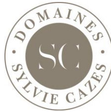
TABLE DU BIEN-MANGER depuis 1895