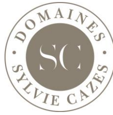
TABLE DU BIEN-MANGER depuis 1895